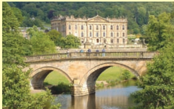
Chatsworth House and bridge

We continue on via Ashbourne, Carsington Water and Wirksworth, on through Matlock Bath to our Tour Finish – Chatsworth. Home of the Duke of Devonshire this jewel in the Peak District will mark a fitting end to our five day tour of one of the most beautiful regions in England.