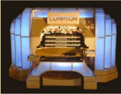
Pipes in the Peak at Thorpe

On Saturday 4th we concentrate on the western side of the Peak District taking in landscapes with panoramic views over Manchester and beyond.