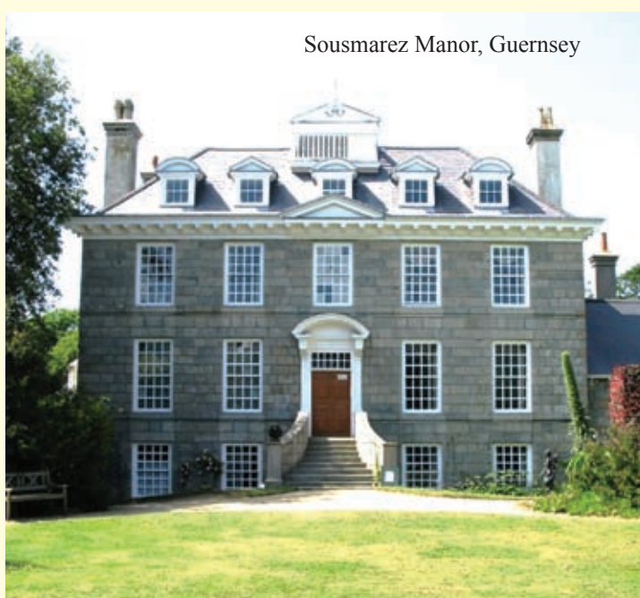
Sousmarez Manor, Guernsey