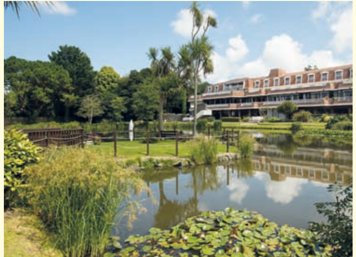
St Pierre Park Hotel, Guernsey.