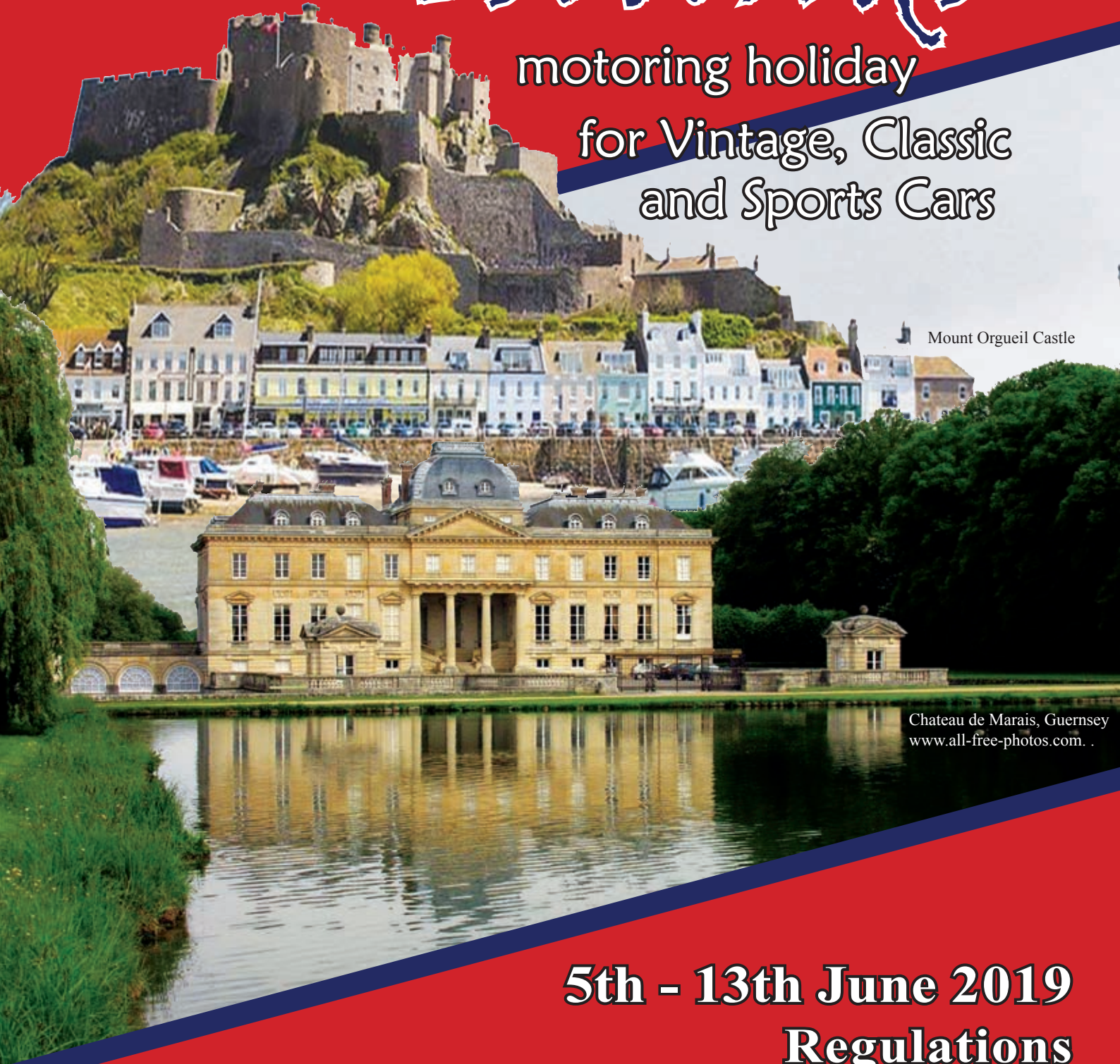
Mount Orgueil Castle