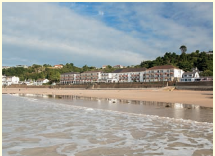
L'Horizon Beach Hotel, Jersey.